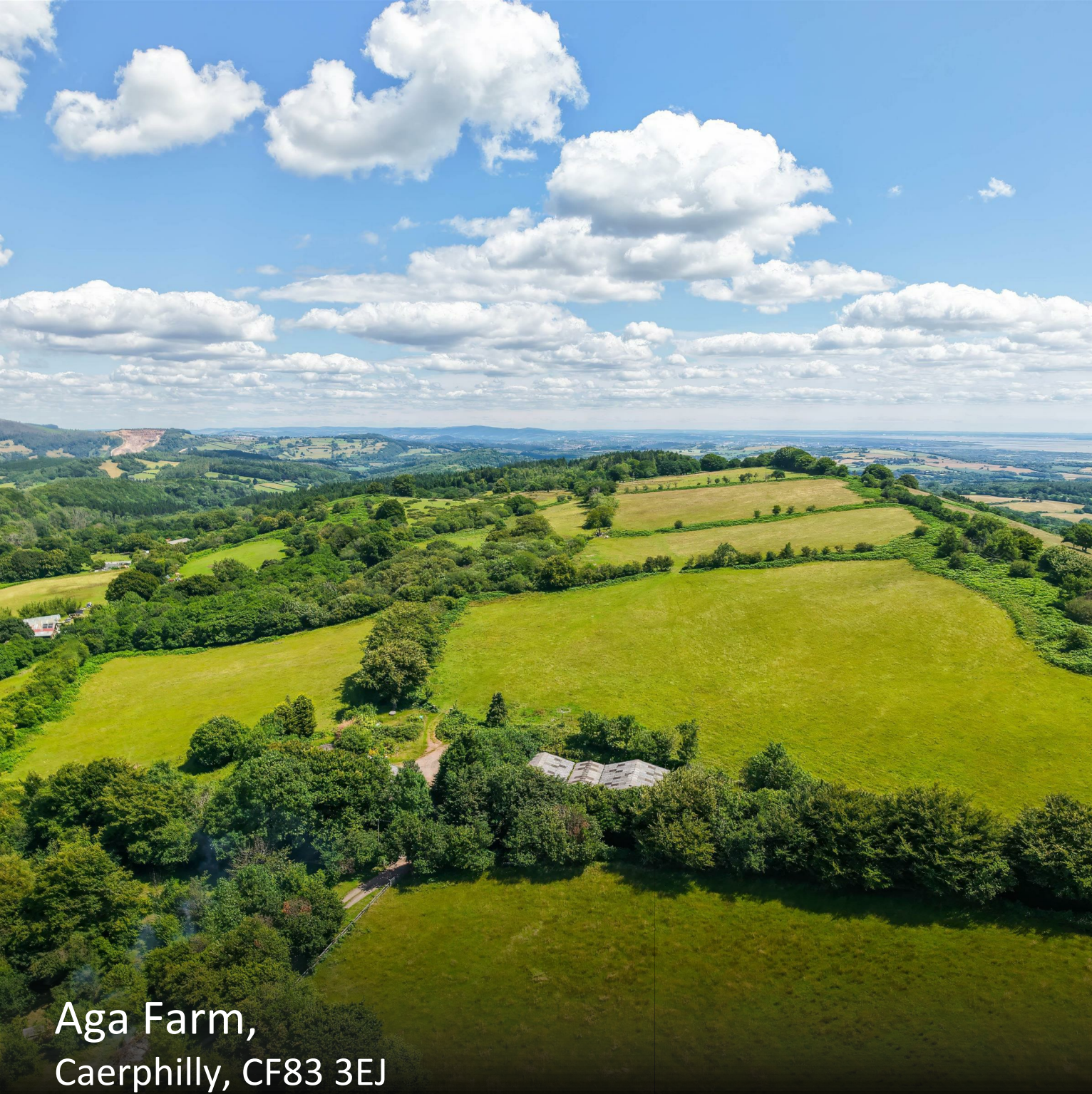
Aga Farm, Caerphilly, CF83 3EJ